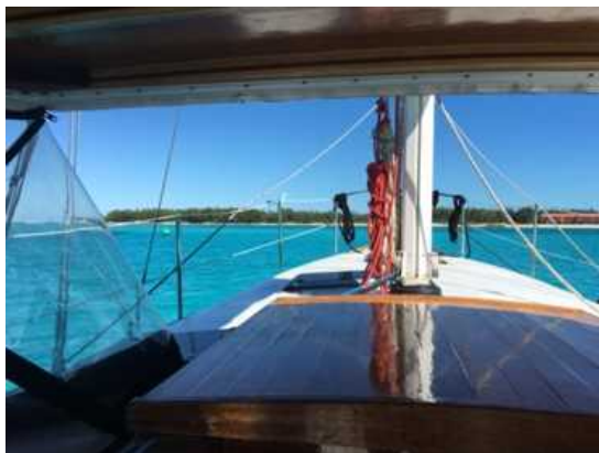
Arriving in the Bahamas!

It is a rough life. All the swimming, snorkeling and lying on the beach. The football final a few nights back which we watched with some American friends was especially greuling.